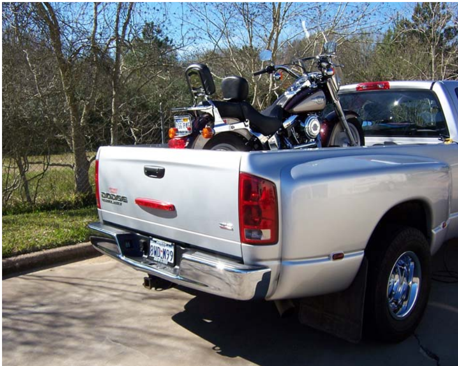
Dodge 3500 8" Bed Length