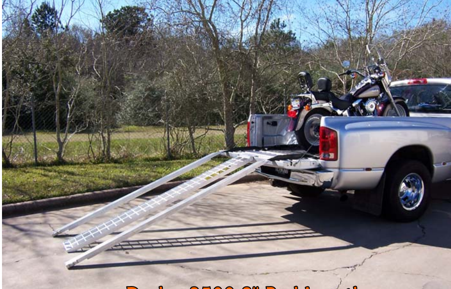
Dodge 3500 8" Bed Length

The photo below shows a 95 th anniversary HD Fat Boy loaded into a pickup.